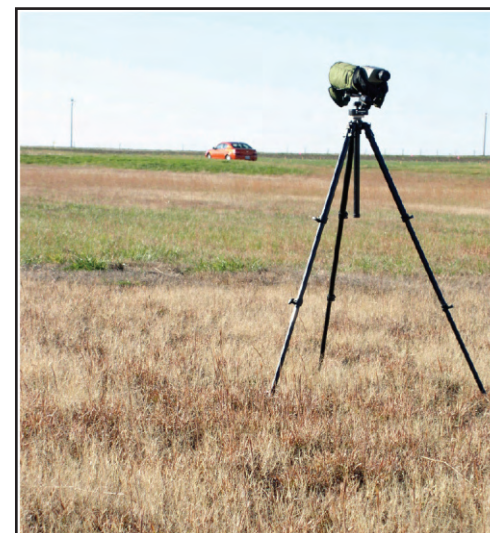
Bradford Farm