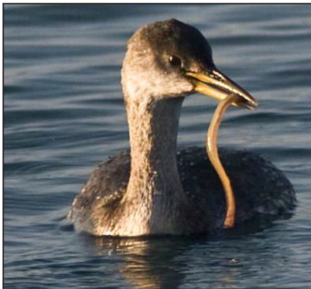
Red-necked Grebe

Abbreviations used: AB = Arcata Bottoms, AD = Alexandre Dairy; AEB = Arcata-Eureka Bottoms; AMP = Arcata Marsh Project; AOP = Arcata Oxidation Pond; BRR = Bear River Ridge; BSLP = Butcher Slough Log Pond; CCH = Crescent City Harbor; EC = Eureka Channel; ERB = Eel River Bottoms; ERWA = Eel River Wildlife Area; HBNWR = Humboldt Bay National Wildlife Refuge; KS = King Salmon; mo = many observers; MRC = mouth of Redwood Creek; MRE = Mad River Estuary; NC = not confirmed; ND = no details; NJ = North Jetty; SRB = Smith River Bottoms; Tdad = Trinidad.