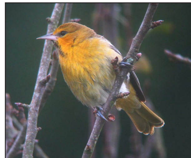
Bullock's Oriole, Smith River