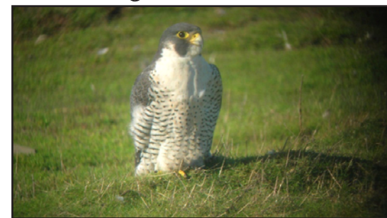
Peregrine Falcon, South Spit Humboldt Bay