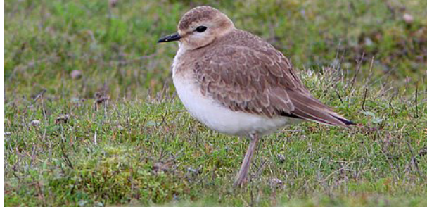
Mountain Plover