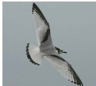
Black-legged Kittiwake

We look forward to seeing you on field trips and monthly programs.