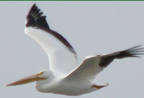
American White Pelicans over Eel River

For more information or special accommodation, call (707) 733-5406 or visit http://www.fws.gov/humboldtby .