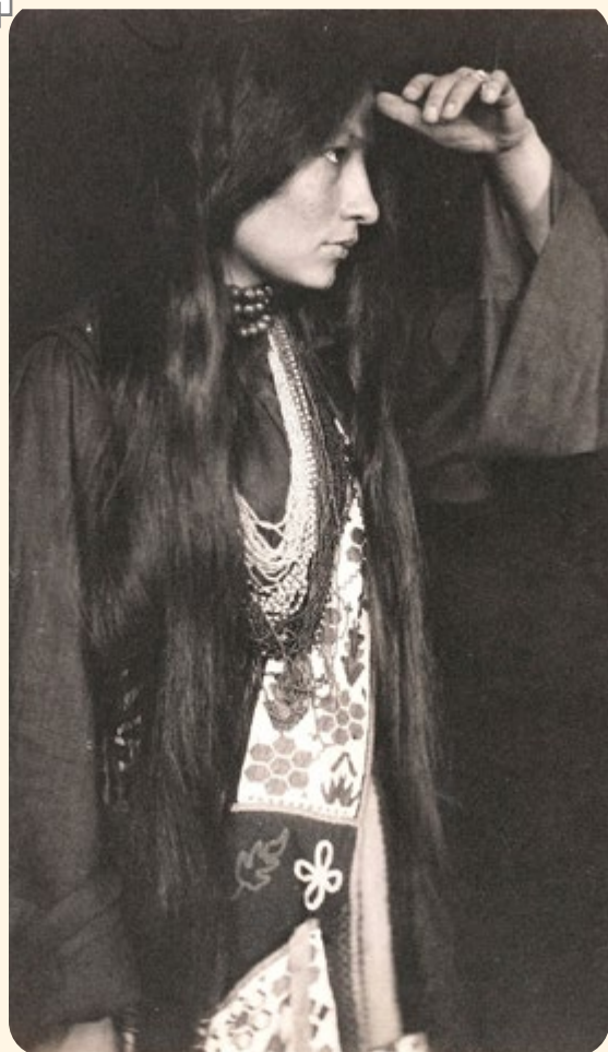
Above: Zitkala-Šá, courtesy of National Museum of American History, Smithsonian Institute.

Above: Daisy teaches children about birding.