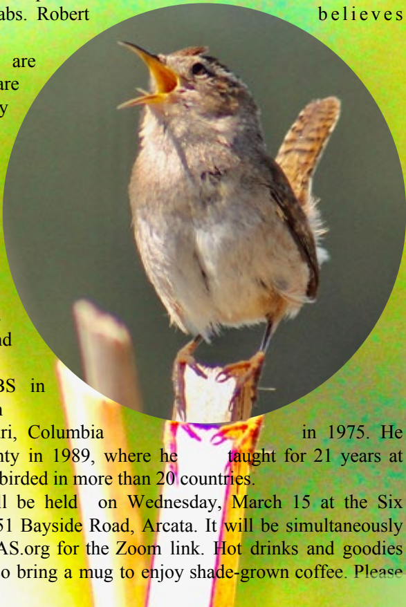
Above: Marsh Wren

The live program will be held on Wednesday, March 15 at the Six Rivers Masonic Lodge, 251 Bayside Road, Arcata. It will be simultaneously zoomed – please go to RRAS.org for the Zoom link. Hot drinks and goodies will be served at 7 p.m. so bring a mug to enjoy shade-grown coffee. Please come fragrance-free.