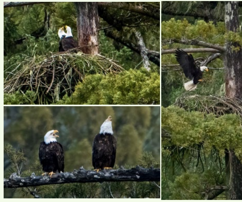
Photos of a shawedoushilh nest in Southern Humboldt by wildlife photographer, Ann Constantino: "I have been following this nest for ten years now and at least one bird has fledged every year, except 2013."