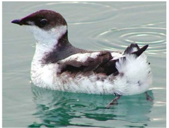
Above: Marbled Murrelet

(For more information on Elliott State Forest, see <a href="https://biologicaldiversity.org/w/news/press-releases/court-halts-logging-of-elliott-state-forest-tract-sold-to-private-timber-company-2022-06-28/">https://biologicaldiversity.org/w/news/press-releases/court-halts-logging-of-elliott-state-forest-tract-sold-to-private-timber-company-2022-06-28/</a>.)